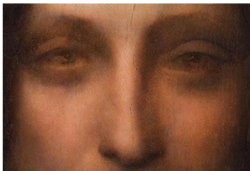
THE MESSIAH John 1:35-42

Before we continue, let us look at the concept of the “Messiah,” the Anointed One of God.